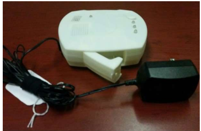
Figure 2: Wireless Methane detector for UL Testing

The original residential methane detector is completing pilot testing in a range of residential environments. The wireless detector units are being built to submit to UL for certification. In parallel, the unit will also go through 3 rd party testing for Z-Wave/ FCC certification for wireless communications. Commercialization discussions are on-going.