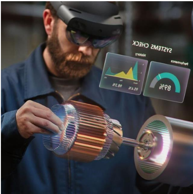
Figure 1. Microsoft HoloLens Application Example

Augmented Reality (AR) and Virtual Reality (VR) have swept innovation into various industries in recent years. The technology provides a creative solution to add efficiency in workflow and numerous ways to optimize business operations. AR and VR implementation have proven to increase productivity within workforces across industries.